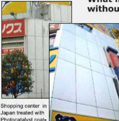
Shopping center in Japan treated with Photocatalyst coating since 2002. No cleaning was done since the application.