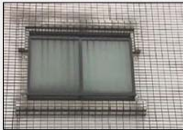
Wall becomes stained from years of dirt and dust accumulation