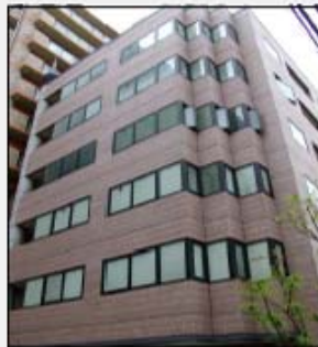
Apartment building in Kobe, Japan treated with Photocatalyst coating in 2003. Building stays clean without spending any resources on cleaning.