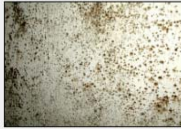
Unsightly stain caused by mold and mildew.